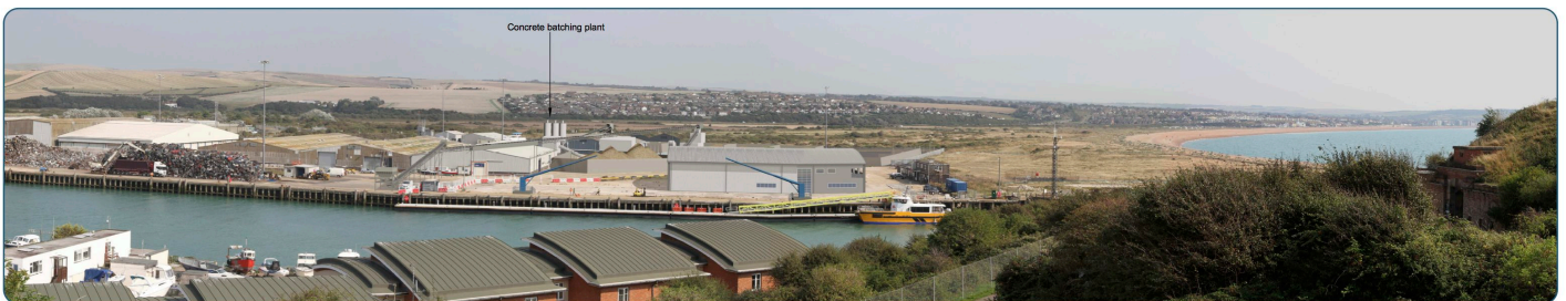
Stage 3 Development - as per Stage 2 and with the concrete batching plant added