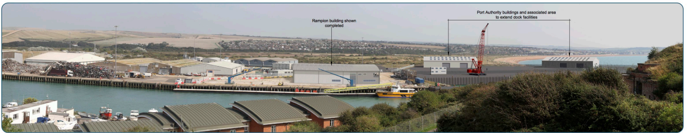
Baseline View - Existing view together with buildings associated with the port extension